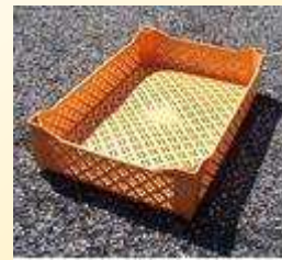
open-weave tray with raised corners